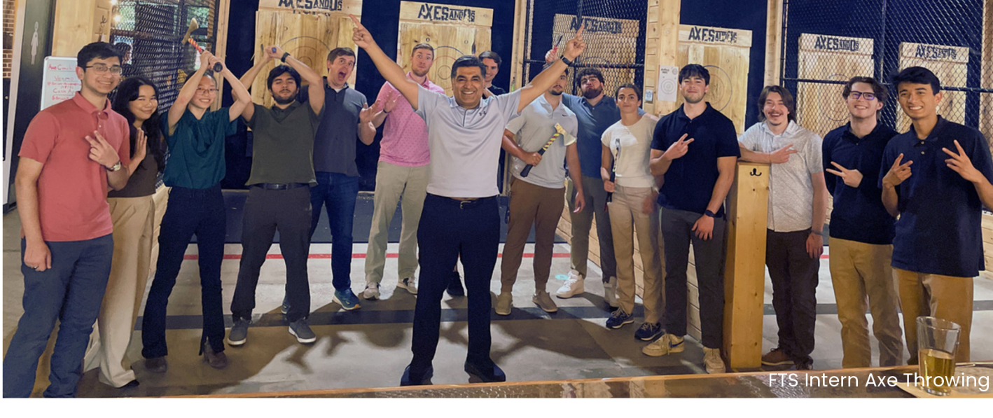
FTS Intern Axe Throwing